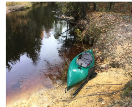
UPPER MULLICA RIVER, MULLICA TWP.

The partners and Friends Along the Mullica can help each other move toward a more sustainable future.