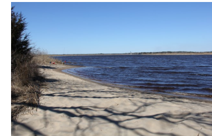
CLARKS LANDING, EGG HARBOR CITY