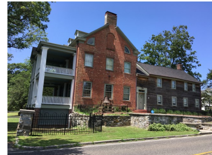
MICAJAH SMITH HOUSE (THE FRANKIN INN) PORT REPUBLIC