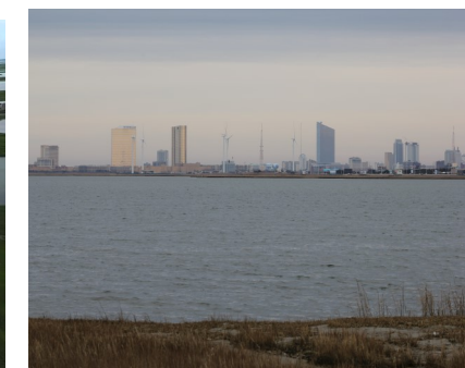
ATLANTIC CITY SKYLINE