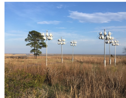
EDWIN B. FORSYTHE NATIONAL WILDLIFE REFUGE, GALLOWAY TWP.